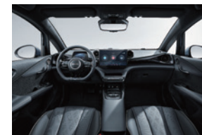
Black and grey