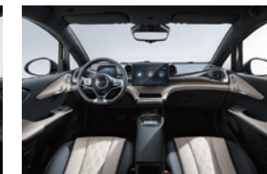
Black and brown